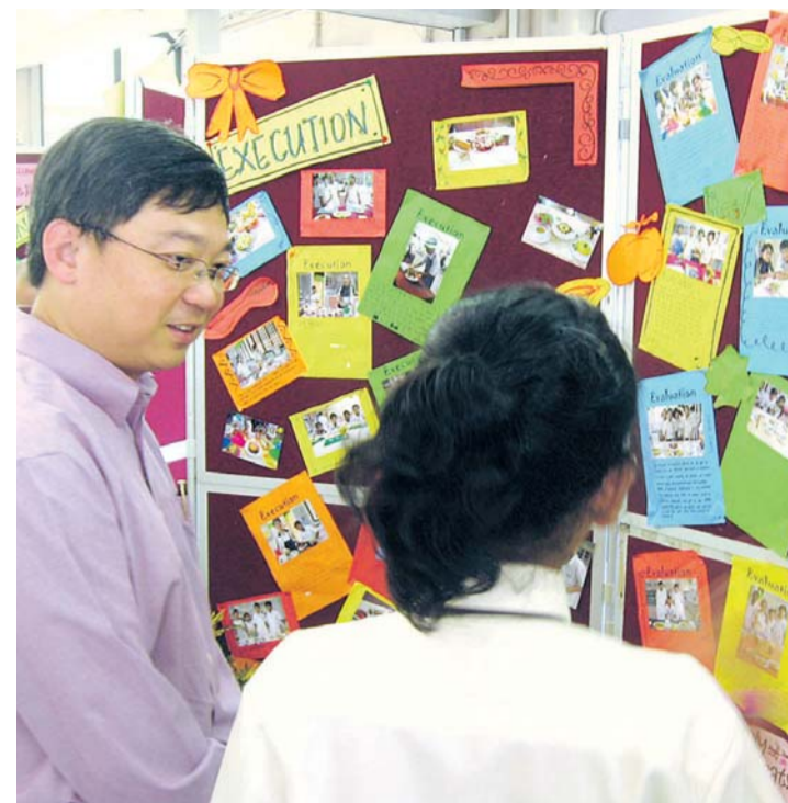
BEYOND THEORY: Minister of State for Education Gan Kim Yong at Dunman Secondary, one of the eight schools offering applied subjects next year.

An exhibition is now on at the Habitat Forum, HDB Hub. Interested applicants can also log on to www.hdb.gov.sg/esales . Applications close Nov 14.